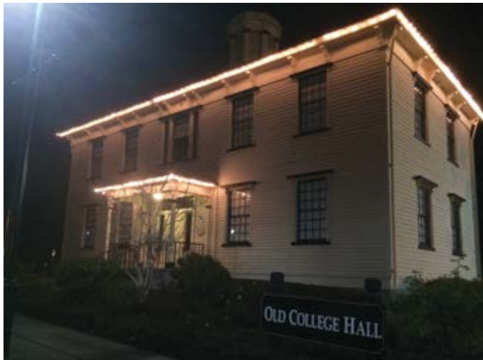
OLD COLLEGE HALL, FOREST GROVE

Hosted by the City Club of Forest Grove with support from the City of Forest Grove.