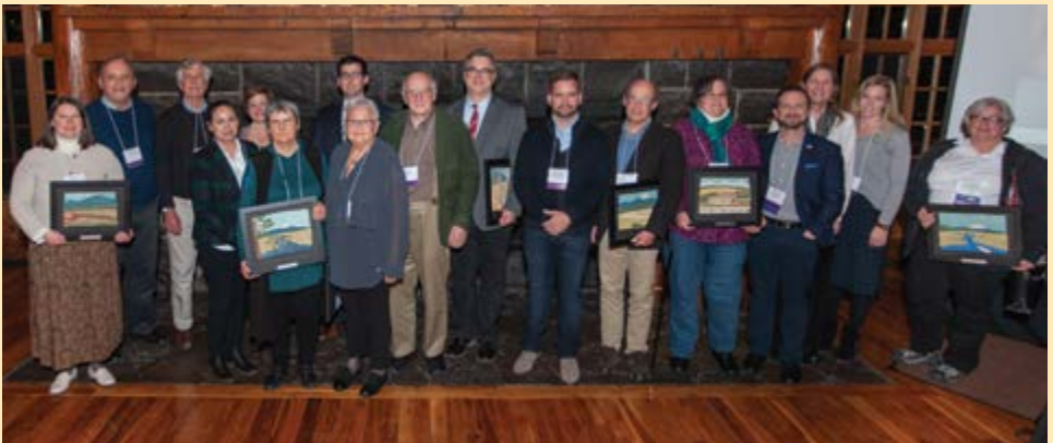
2018 OREGON HERITAGE EXCELLENCE AWARDEES.