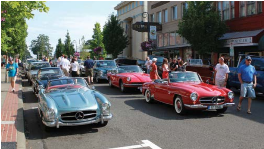
CARS ON MAIN STREET.