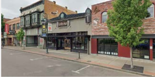
DOWN TOWN FOREST GROVE

The next four days will provide the opportunity to find ways to make space to clear the clutter, set priorities, build relationships, and plan for the time it takes to move important heritage work forward. Some of these ways may be small, practical steps, others might involve a shift in perspective, and some ways may feel uncomfortable. Take this opportunity to engage with Oregon's amazing heritage community to work through ideas and challenges, but also embrace opportunities and successes.