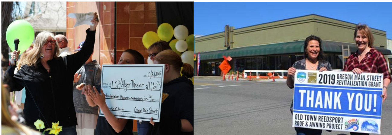
Celebrations in Lakeview and Reedsport!