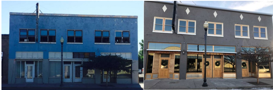
Central Hotel, Burns 2017 awarded project. Vacant for 40 years and now a hotel and two businesses.