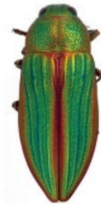
Above: Golden jewel beetle

Oregon citizens can quickly log a report of any suspected invasive species to the hotline, using a mobile device or computer. Before making a report, members of the public are urged to first check with ODA's EAB lookalike reference guide to rule out that what they're seeing isn't a harmless insect, such as the golden jewel beetle (see photo at right).