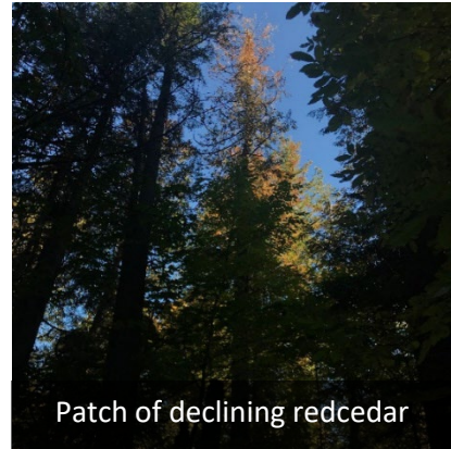
Patch of declining redcedar

Top-dieback, branch mortality, crown thinning and whole-tree mortality in all ages of western redcedar has been observed recently at lower elevations in the Willamette Valley and beyond. Although it is common to see 'spiked' or dead tops in older western redcedar, usually there are living lateral branches and a functional crown. No single factor has been identified in these more recent die offs, but a combination of poor or unsustainable growing conditions may be to blame. Redcedar may simply be growing in areas or within microclimates outside of their preferred range or areas that are no longer sustainable for long-term growth under current climate conditions.