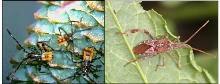
Western conifer seed bug nymphs (left) and adult (right)

When using pesticides, always read and follow the label