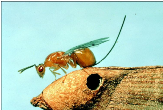
Newly-emerged seed chalcid alongside exit hole

Destroying infested cones before September may reduce populations or delay insecticide use. Removing the duff layer in the fall may expose larvae to predation and cold temperatures. Use pheromone-baited traps to monitor emergence. Monitoring to detect the start of larval damage and evaluate damage rates should start 2 weeks after the first adult is found in traps. Chemical sprays may be applied in early June. Use pheromone-baited traps to monitor for adult emergence using traps to correctly time sprays.