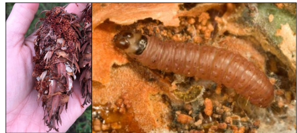
Coneworm frass (left) and coneworm larva (right)

chemical sprays may be used to control adult midge populations if applied at the correct time (early spring before peak adult emergence, see USFS publication FHP-WSC-04-01). Use pheromone-baited traps to monitor for adult emergence using traps to correctly time sprays. Note that many other types of similar-looking, non-damaging flies may be collected in traps. Systemic injections can be used to target larval life stages.