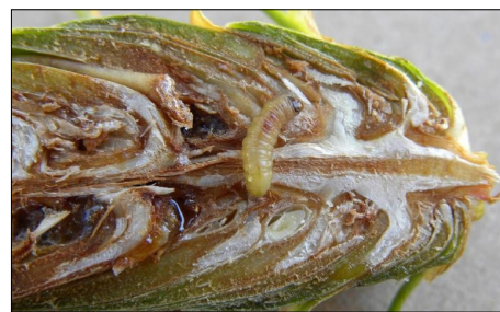
Adults are < 1/3" long

The western conifer seed bug is a type of leaf-footed bug that feeds on and damages seeds from Douglas-fir, pines and incense cedar. Adults are 1.5-2 cm long with distinctly flattened, leaf-like segments of hind legs. Overwintering adults emerge in May or June and lay eggs on needles. Nymphs emerge and feed on seed ovules which can cause conelets to abort. Late stage nymphs and adults suck juices from seeds from outside the cones. Feeding continues until the weather cools or seeds drop from cones. Damage is not detectable externally on cones but the insect itself can be seen. Heavy feeding can cause up to 40% seed loss in Douglas-fir.