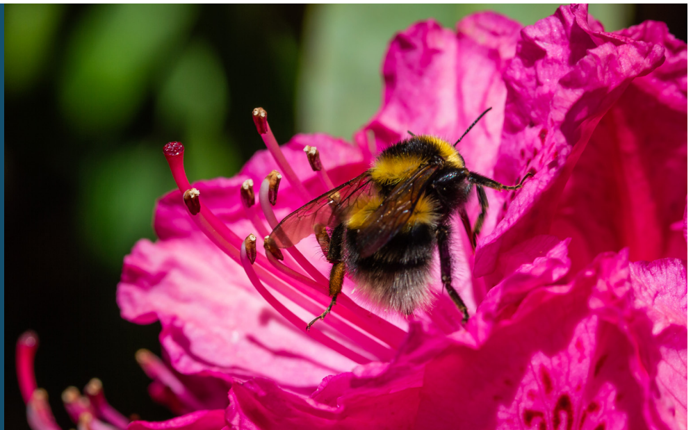
Bumble bee on a rhododendron flower