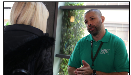
Attendees had the opportunity to speak directly with PERS retirement counselors and other financial experts.

And don't forget next year's Expo, which is set for Wednesday, October 7, 2020 , at the Salem Convention Center.