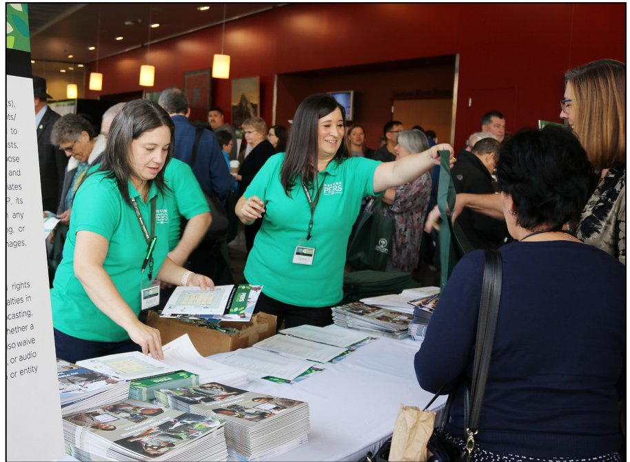
PERS puts on this annual event for the benefit of members at all stages of retirement planning.

This prestigious award is given in recognition for “the brightest ideas and most innovative solutions” in helping public employees save more for retirement. PERS was also honored by the Retirement Advisor Council for the success of Expo 2018 with a 2019 Excellence Award – Financial