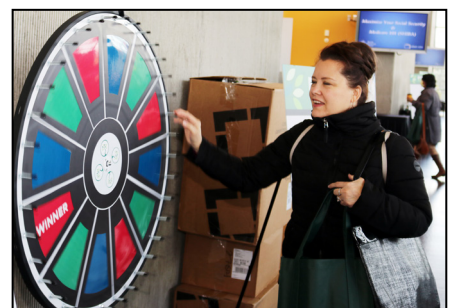
Members had the chance to win prizes after testing their retirement planning knowledge.