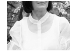
Sheer, transparent, or mesh fabric (other than hosiery)