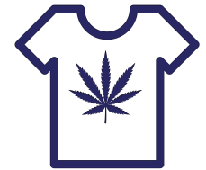
Messages that promote drugs, tobacco, alcohol, violence, pornography, nudity, gangs, or prejudice, or are demeaning to others