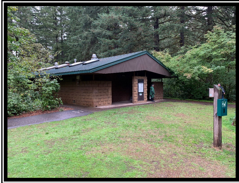
Figure 1 – Existing restroom building.