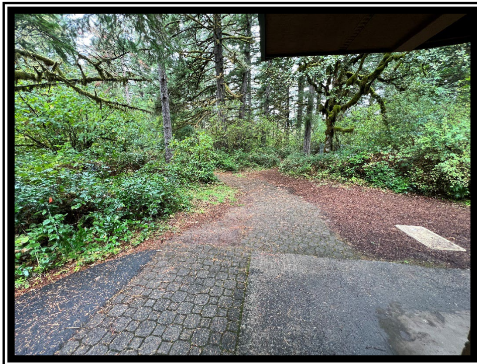
Figure 2 – Path to ADA site, uneven pavers.