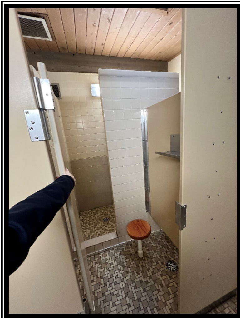
Figure 4 – Non-ADA showers, numerous partitions impede movement.