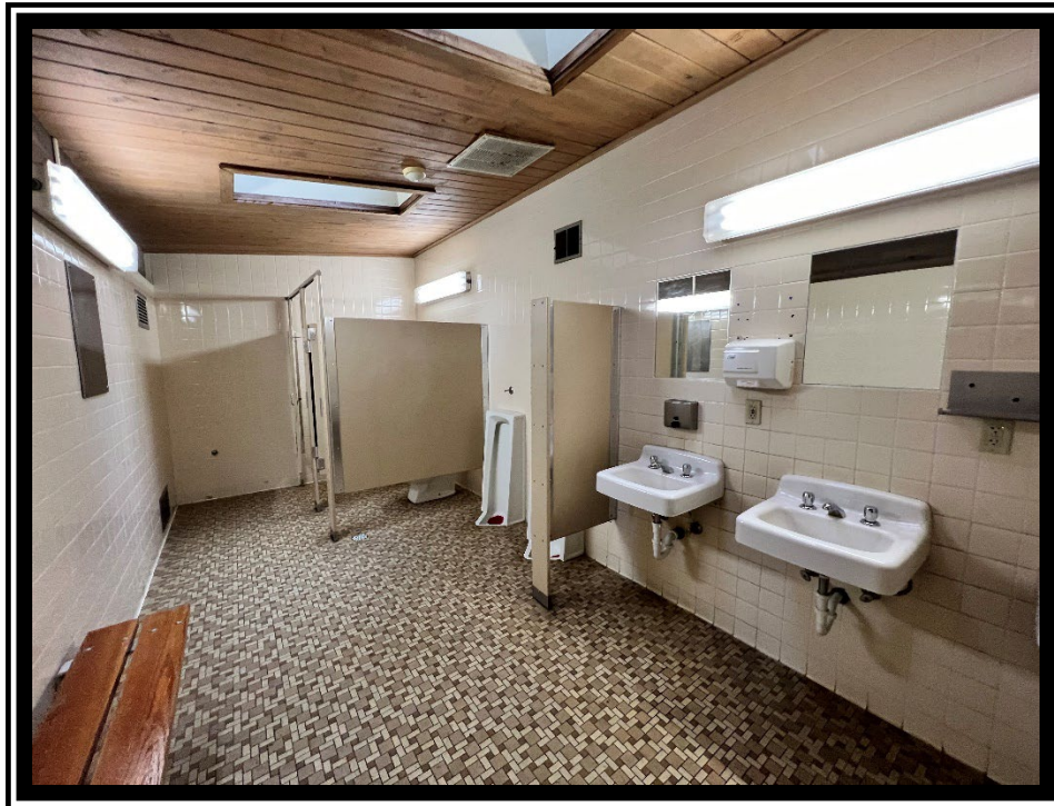
Figure 3 – Numerous repairs, difficult to maintain.