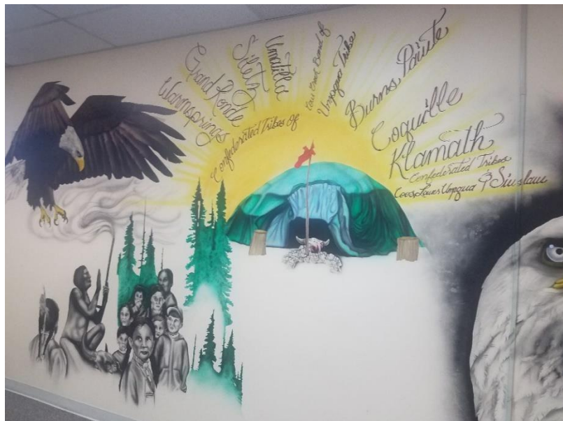
A list of Oregon tribes on the wall at the NARA Wellness Center

In 2016, OHA assembled a state behavioral health collaborative to improve systems of care in Oregon. In response to this effort, Oregon tribes, NARA, and the Northwest Portland Area Indian Health Board (NPAIHB) articulated a need to collaboratively address behavioral health care needs in Oregon tribal communities and more specifically and appropriately respond to the unique systems operated in the communities they represent.