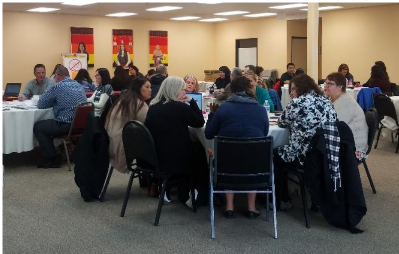
Participants collaborate on strategic planning considerations

For example, implementing systems through which tribes can train and accredit their own workforce will help create a culturally informed workforce. OHA and tribes/NARA can achieve effective, consistent communication and strengthen their partnership through regular reporting and trainings for OHA and tribal leadership. The following sections of this document highlight the shared vision and offer a detailed look at the strategic pillars and outcomes that outline how the collaborative will surmount these challenges.