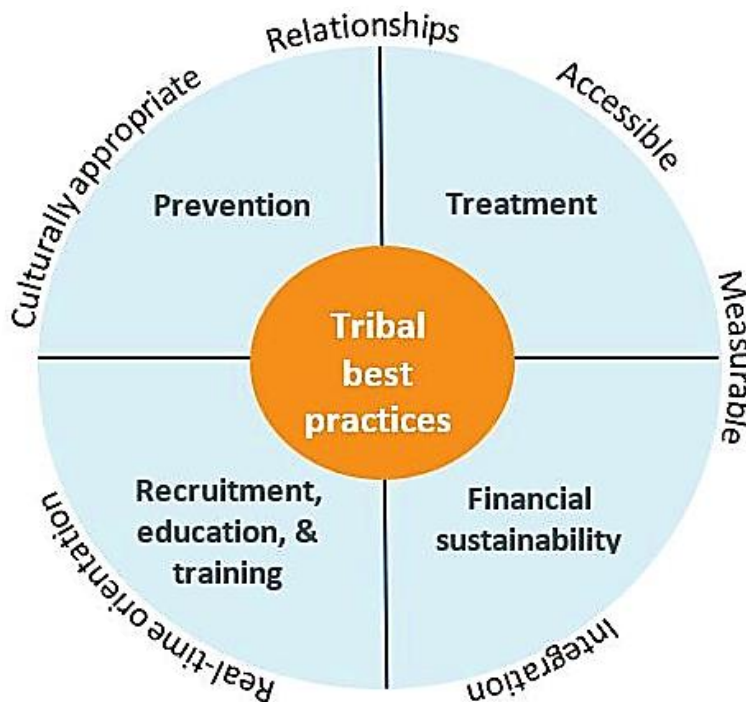
Figure 1. A medicine wheel that represents the collaborative's vision

Figure 1 is a visual representation of the shared vision, as depicted by strategic planning participants.