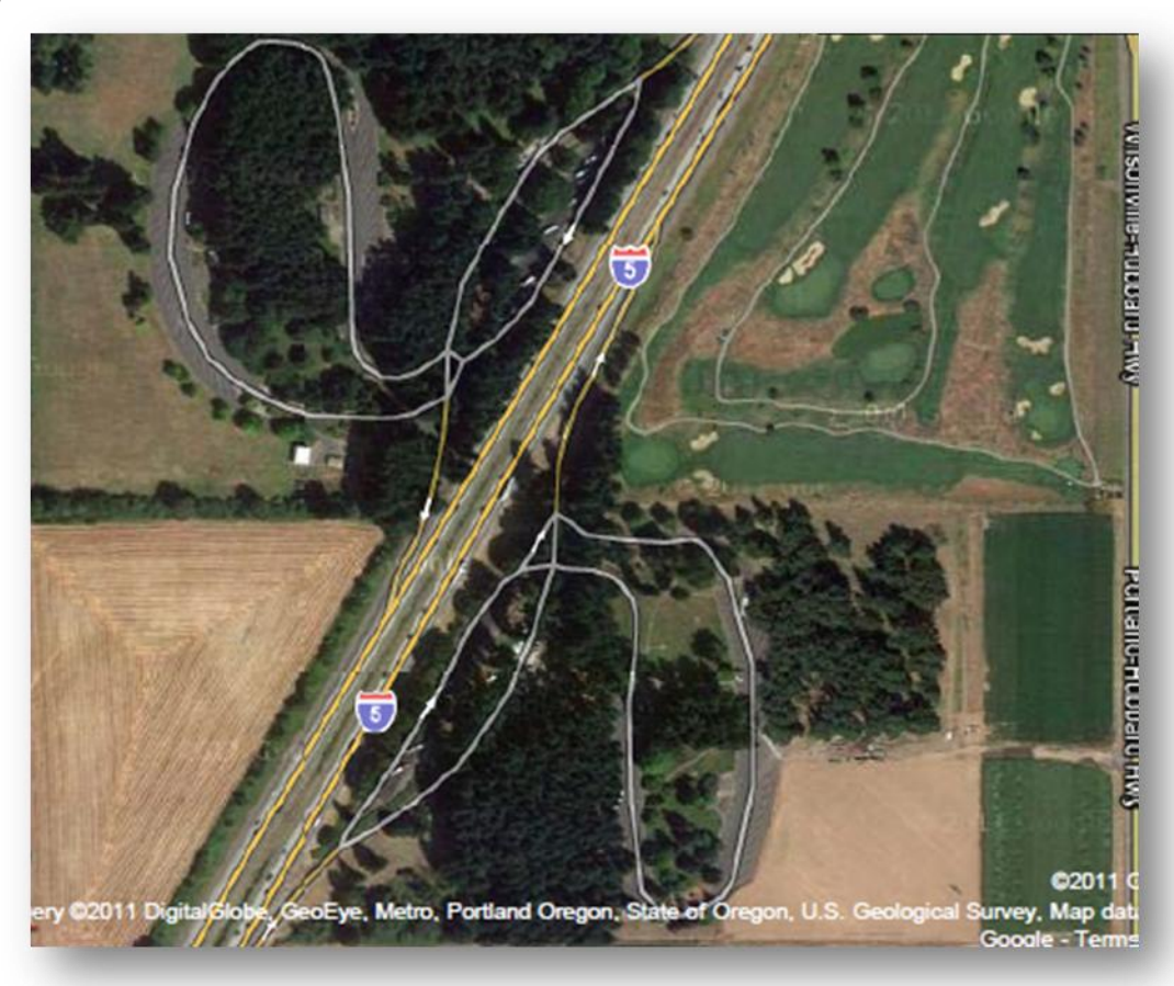
Image of Baldock Rest Area on I-5, Near Wilsonville

The 86-acre Baldock Rest Area, depicted above, consists of two sections of approximately the same size (northbound is 42.54 acres and southbound is 43.43 acres) that fall along either side of I-5 near Wilsonville, Oregon. Constructed in 1966 as part of the Oregon Interstate Highway System, the rest area