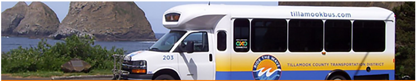
A shuttle bus connecting coastal communities in Tillamook County.