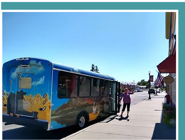
A Gilliam County Transportation bus stopped in Condon.

This study will engage housing agencies, developers, transit providers, local and tribal governments across Oregon to identify policies and actions that improve access to attainable housing and convenient, reliable transit.