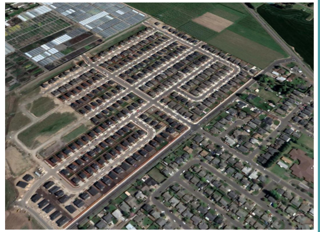
A new development at the urban fringe with a half-mile walk to the nearest transit stop.