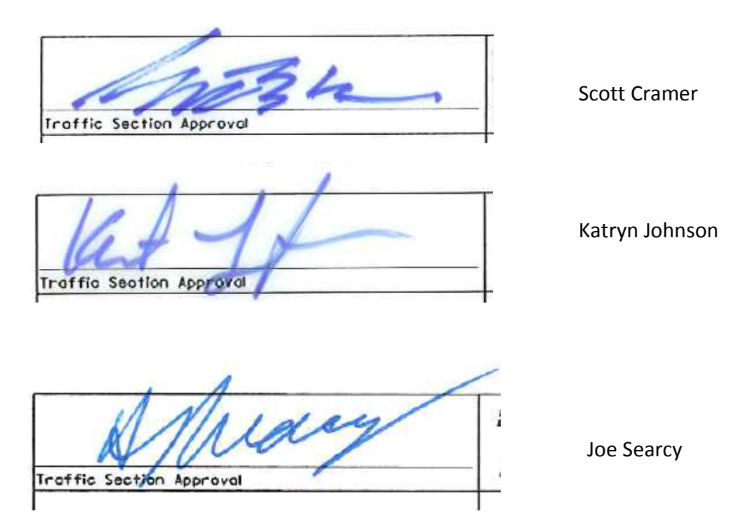
Figure 2-3 | Authorized Signatures

Each signal related plan sheet shall contain a signature block for "Traffic Section Approval". When all comments on the signal plans have been resolved to the Traffic Signal Engineer's satisfaction the final plans are printed on mylar, sealed by the Engineer of Record, and sent to the Traffic-Roadway Section for signature. The approval signature is required to be either the Traffic Signal Engineer or person(s) that are authorized by the Traffic Signal Engineer (typically a member of the Traffic Signal Standards Unit). See Figure 2-3 for authorized signatures.