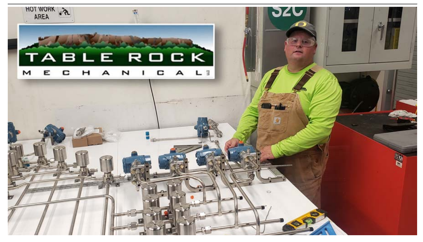
Table Rock Mechanical Finds Purpose in Mentorship