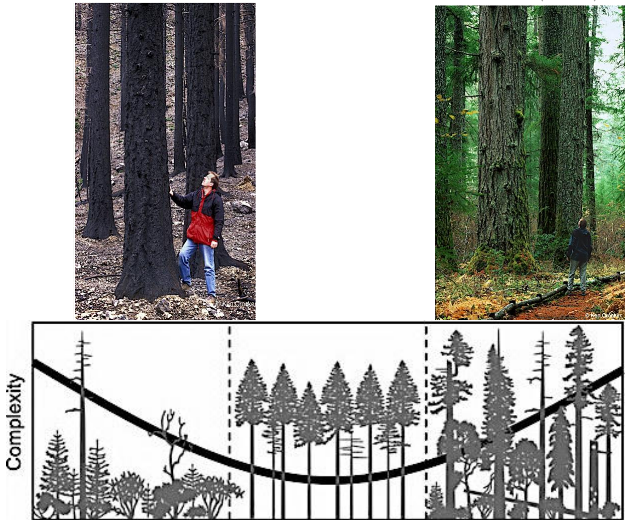
Figure 1. Stand level complexity across a seral gradient (Donato et al. 2012). Note: Forest succession is not linear, rather it is cyclical and even within a mature forest, gap phase dynamics replenish legacies but the initiating disturbance creates the vast majority of them through a pulse event whereby patches of mature trees are killed by the natural disturbance that are linked to the structural features carried through seral stages.

ODF claims some of the aforementioned timber sale areas have nothing living in them. In my decades of working as a forest ecologist, I have never witnessed any severely burned stand with nothing living in it. In fact, DellaSala and Hanson (2019) documented extensive conifer establishment shortly after severe fire patches thousands of acres in size in pine and mixed conifer forests throughout the West. Even in the largest severely burned patches, conifer seed sources (live trees) were present within the burn patch interior and conifer seedlings present in 1-5 years postfire. ODFs claims run counter to best available published datasets on post-disturbance processes, including the role of biological legacies in all severely burned forests (mycorrhizae, seed sources in the soil, surviving shrubs and forbs, live and dead trees – the severely burned forest is alive if you know what and where to look). Contrary to ODFs assumption, CESF actually contain a rich diversity of small mammals and birds that depend on the complex structures provided by the pulse of biological legacies (DellaSala and Hanson