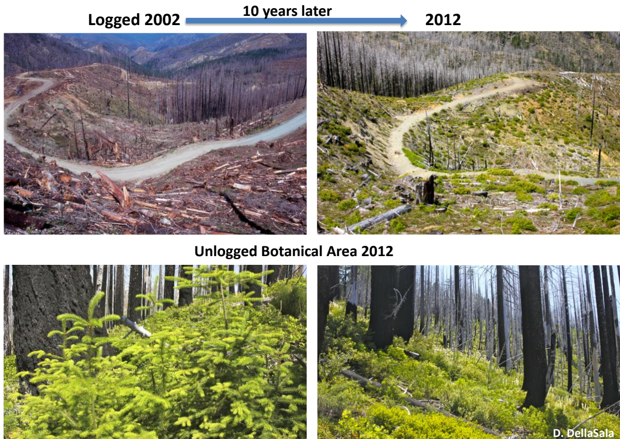
Figure 2. A comparison of logged (top panels) vs. unlogged (bottom panels) in the Biscuit burn area of the Rogue-Siskiyou National Forest across a time sequence. Notice the lack of structural retentions 10 years after the burn and the lack of conifer establishment in the logged areas (top panels) where some trees were retained compared to unlogged botanical areas that show a proliferation of growth and legacies. Large dead trees in the botanical area anchor soils, provide shade for developing conifers and other vegetation, and even though severely burned, the stand was full of life.

Figure 3 below illustrates the connection between complex early and late seral forests in a natural disturbance sequence that links seral stages through time via the pulse of biological legacies created in a severe disturbance in a mature forest with structure (top sequence). In the unlogged natural system, a beneficial relationship of biological legacies and ecosystem processes is maintained across seral stages. In the logged sequence, a damaging feedback loop is created whereby most – if not all – of the biological legacies are removed setting in motion a novel disturbance cycle where fire or logging repeatedly removes trees before they can acquire legacy structures. That is – ODF’s claim that logging is needed to retain complex structures or created desired future older conditions is completely unsupported.