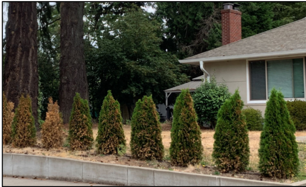
Arborvitae (western redcedar or eastern whitecedar cultivars) prefer cool, shaded environments and is not drought tolerant. It does not like crowding but it is often planted in rows in dry, sun-exposed lawns and slowly dies unless irrigated. Drought weakens tree defenses, allowing beetles to move into these trees and finish them off.

Climate change has resulted in long droughts and heatwaves across the state. So our landscape trees could use a little help from irrigation. You can aid them by planting the right tree in the right site and removing grass and other plants nearby that compete for moisture (leave some understory plants to prevent soil drying from sun and wind). Watering a drought-stressed tree will not bring back yellowing leaves but does prevent the loss of other leaves and death of roots and water transport tissues. Common symptoms of drought in trees are: