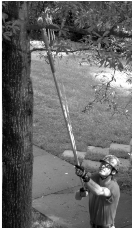
Street tree pruning