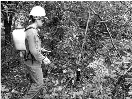
Invasive insect control (and preventative treatments)