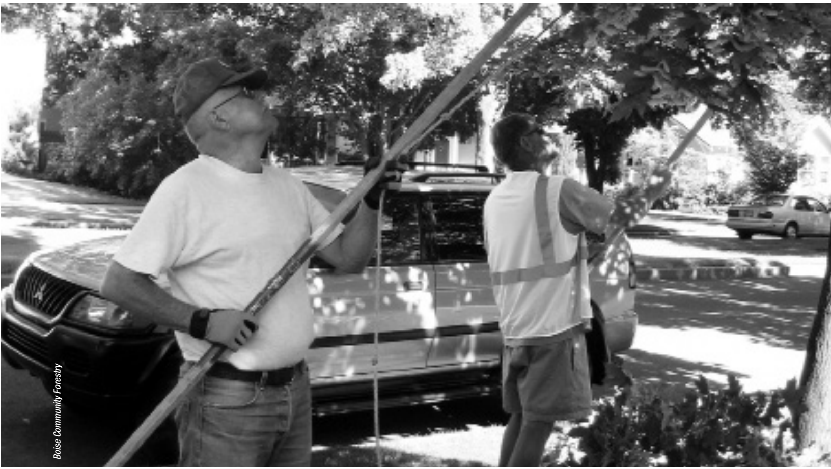
Boise Community Forestry