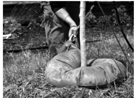
Tree watering and other new tree care