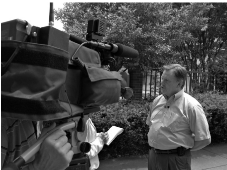
Publicity and marketing