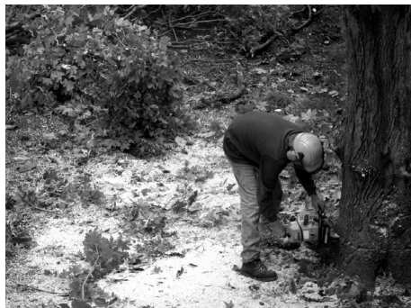
Utility line clearing