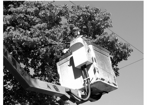
Overhead line clearance