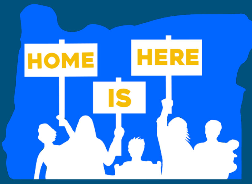
Members of Oregon Department of Education