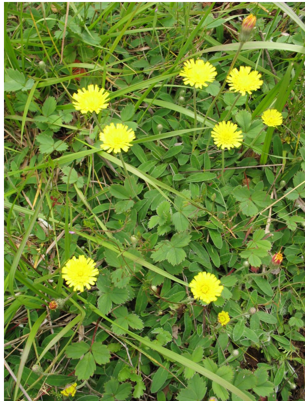
Mouseear hawkweed flowers, photo by Tom Forney, ODA

Introduction: Mouseear hawkweed is a member of the sunflower family and very similar in growth form to the common dandelion. It is an aggressive weed of grasslands, right of way, pastures, lawns and wastelands. Similar to the other hawkweeds, mouseear hawkweed plants thrive in a wide variety of soil conditions but prefer semi-arid, sunny soils, sandy soils and less fertile sites. Early herbarium specimens were collected from cemeteries, lawns and wastes areas therefor it is assumed to have arrived from Europe in packing material and not as a seed contaminant. There are reported medicinal properties associated mouseear hawkweed including old, modern and specific remedies for internal and external use. Currently the literature is conflicted as to the plant’s allelopathic properties. The dense mats do create a ‘halo’ around them but this effect is a resulting change of moisture, pH and carbon increases in the soil the plants and not from a chemical extruded by the plants themselves (McIntosh, P. et al., 1995), (Dobson and Scot 1985). Some Internet sites still offer the plant for sale, though sale and delivery to Oregon is prohibited. It is currently listed as a noxious weed in three states though occurring in twenty-four states mostly in the eastern US. Mouseear hawkweed is not a USDA federally listed noxious weed.