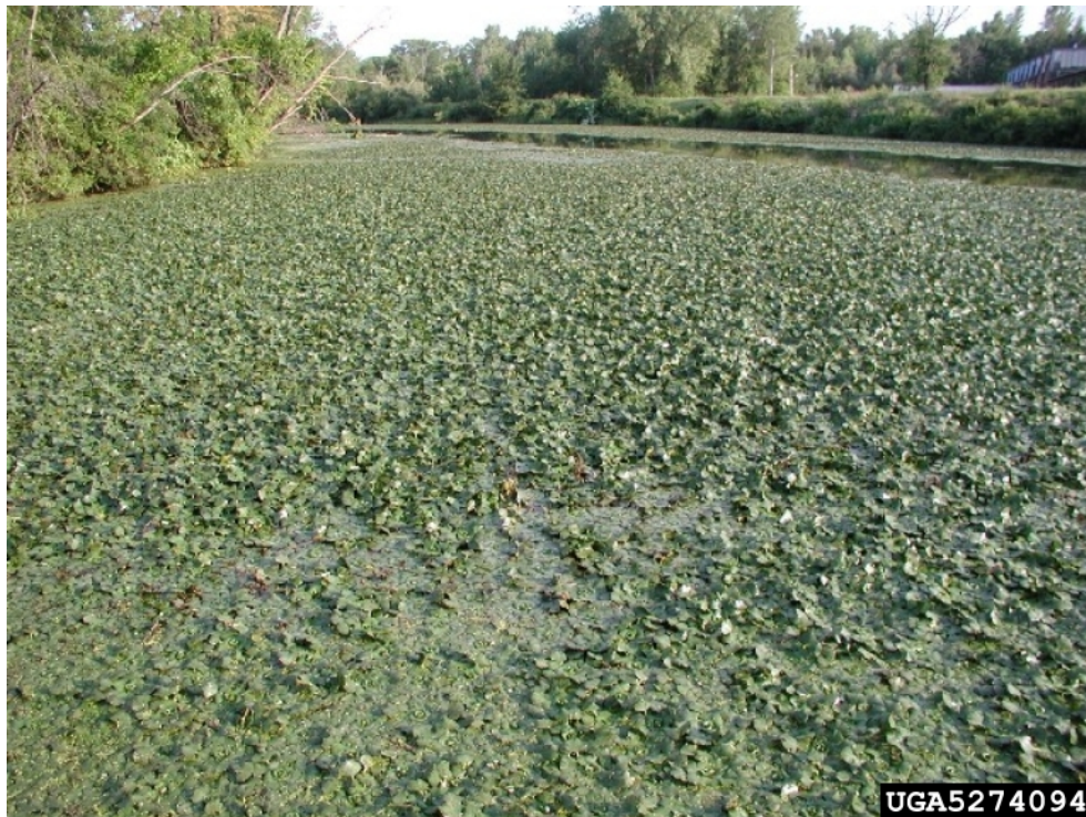
European water chestnut infestation, photo by Leslie J. Mehrhoff, University of Connecticut, Bugwood.org

Environmental Impacts: European water chestnut has become a significant nuisance aquatic weed in the northeastern United States, especially in the Hudson and Potomac Rivers, Lake Champlain and in the Connecticut River Valley. Due to its dense, clonal, mat-forming growths the species impedes navigation; its low food value for wildlife potentially can have a substantial impact on the use of the area by native species. The dense surface mats, like those produced by European frog-bit ( Hydrocharis morsus-ranae ) in southeastern Ontario, likely also reduce aquatic plant growth of other species beneath the shade of the floating canopy. Light extinction under Trapa canopies can reach 100% (Hummel and Finley 2006). The abundant detritus in the fall of each year and its decomposition could contribute towards lower oxygen levels in shallow waters and impact other aquatic organisms. The sharp spiny fruits can also be hazardous to bathers. Research on fish populations within large Trapa beds is extensive and documents steep declines in fish populations (Hummel and Finley 2006). Impacts on dissolved oxygen, nitrogen have been researched and found to be altered in the largest beds (Hummel and Finley 2006). Macro invertebrate fauna has also be researched in the Hudson River under large mats of Trapa and found not to be effected (Kornijow 2010).