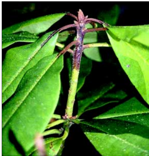
Figure 12 (at right, below).—Ramorum shoot dieback on wild rhododendron.