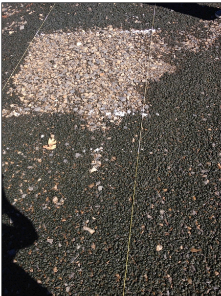
Fig. 2. Nostoc trial at Yamhill Co. site seven weeks after treatments were applied. Plot treated with Scythe is still devoid of Nostoc , while the surrounding area is completely recolonized by Nostoc .