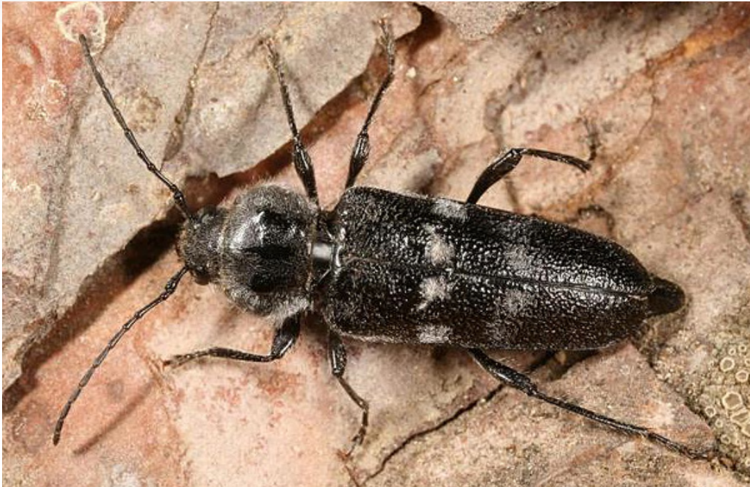
Old house borer

The Oregon Department of Agriculture detected the old house borer, Hylotrupes bajulus (Coleoptera: Cerambycidae) during a woodborer survey conducted in 2013 in The Dalles. A single beetle came to a funnel trap that was placed under the high-tension wires in a cherry orchard. None have been documented anywhere else in Oregon.