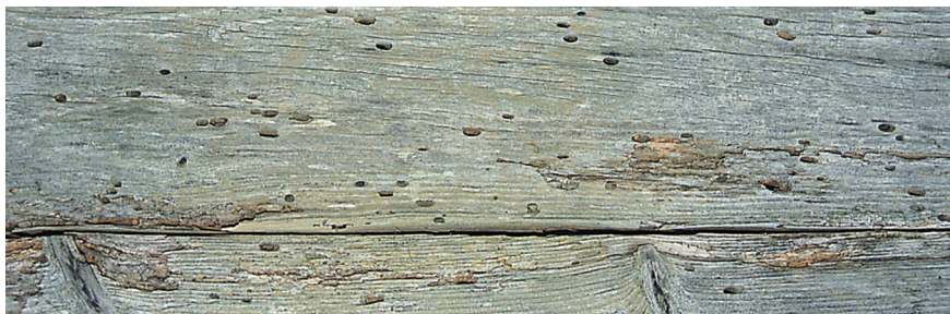
Old house borer damage.