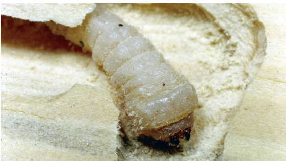
Larva tunneling in wood.

The old house borer is a long-horned beetle. Most long-horned beetles attack dead or stressed trees. The old house borer is unique in the group because it attacks dry seasoned wood including lumber. It prefers softwood/conifer lumber, but it won't attack wood that is painted or varnished. The beetles can re-infest the same piece of wood until it is weakened. The Pennsylvania State University Extension fact sheet states, "The old house borer is one of the most injurious wood-boring insects inhabiting Pennsylvania." In Europe, structural timbers are chemically treated to prevent infestation.