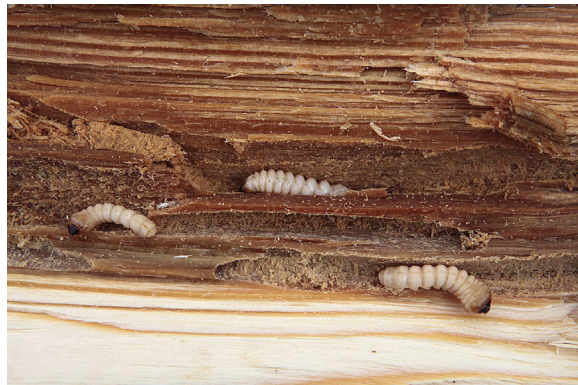
Old house borer damage.