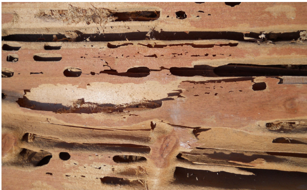
Carpenter ant damage.

If you suspect that you have found old world borer please contact the Oregon Department of Agriculture, Insect Pest Prevention and Management at: plant-entomologists@oda.oregon.gov or 1-800-525-0137.