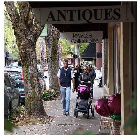
Parking and walking has multiple benefits for people and cities.

[Additional option for on-street] On-street parking in non-residential zones within one-quarter mile of the building may be used toward fulfilling the minimum parking requirements. [An on-street parking space may be counted only once to fulfill an off-street parking requirement, except as provided in [shared parking reference – see #6, below.] The City shall maintain a record of on-street spaces that are