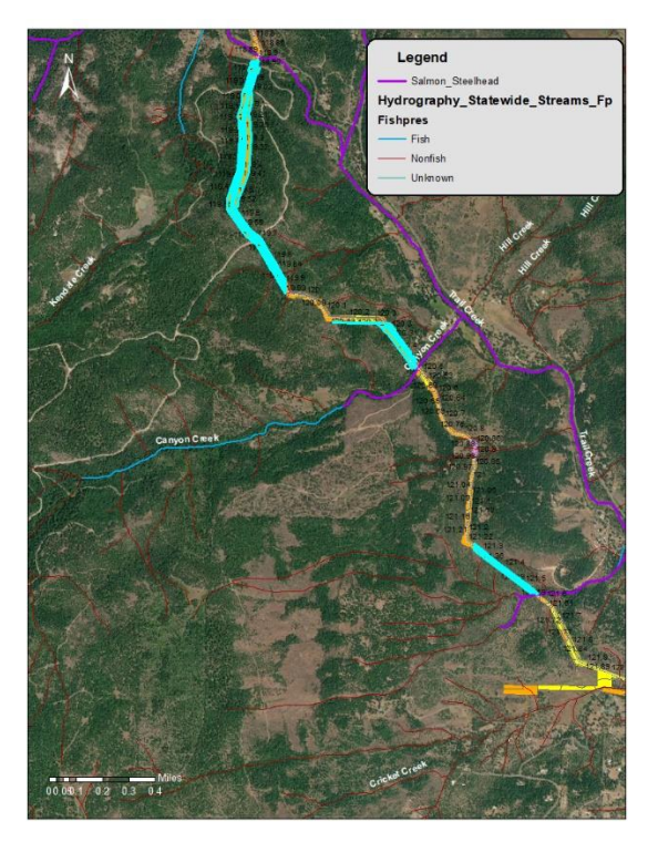
Figure 1. Map noting stream crossing in Trail Creek watershed where LSR will be removed immediately adjacent to a coho bearing stream (LSR highlighted in light blue).