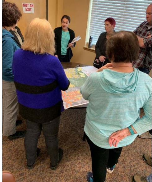
Tsunami evacuation improvement planning meeting, January 2019.

The City of Rockaway Beach undertook a risk-based and community-specific approach to tsunami resilience planning, which resulted in adopted updates to their land use ordinance that will benefit the community in both the short- and longterm.