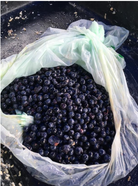
Figure A1: Blueberries found in the business' back-of-house food waste (The bag is approximately 12 inches by 18 inches and 3 inches deep)