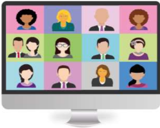
4 Rules Advisory Committee meetings