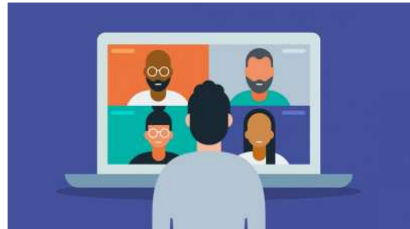
1 Fiscal/Economic Impact Advisory Committee meeting