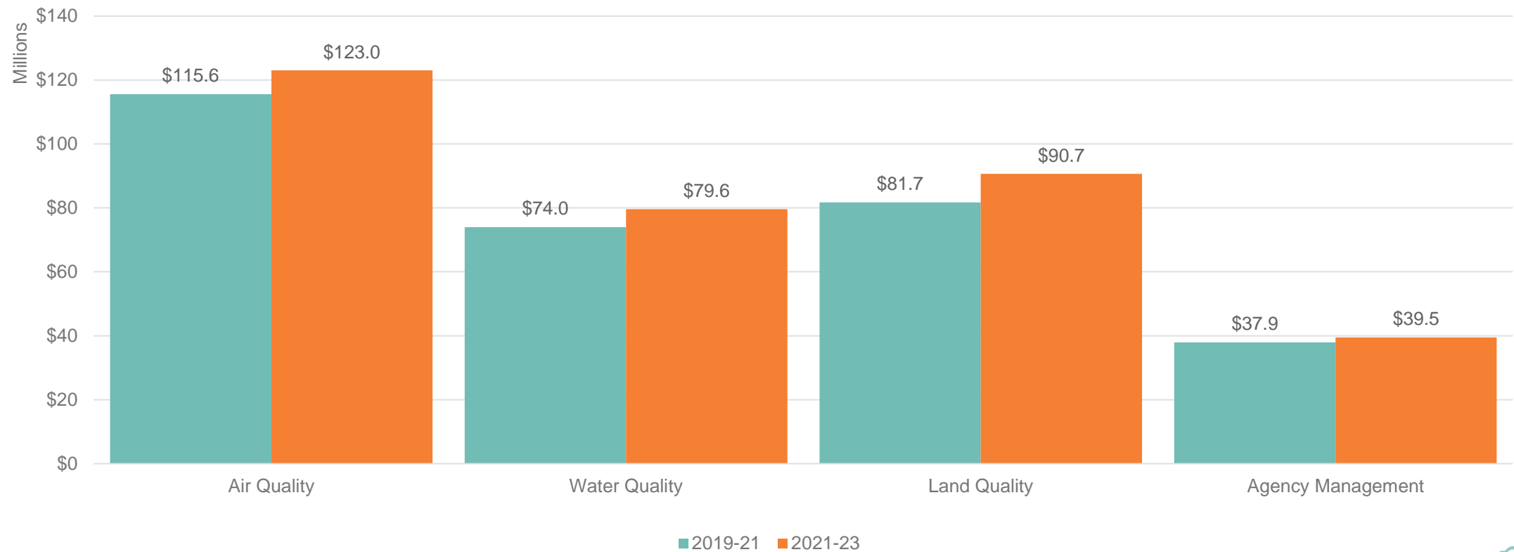
Oregon Department of Environmental Quality Program Comparison of 2019-21 LAB and 2021-23 GRB Limitation