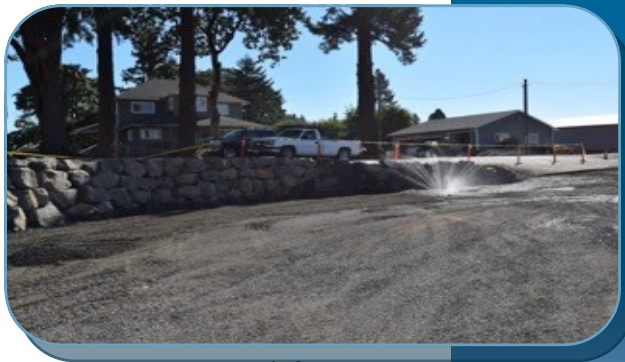
Twin Oaks Access Taxiway: before and after