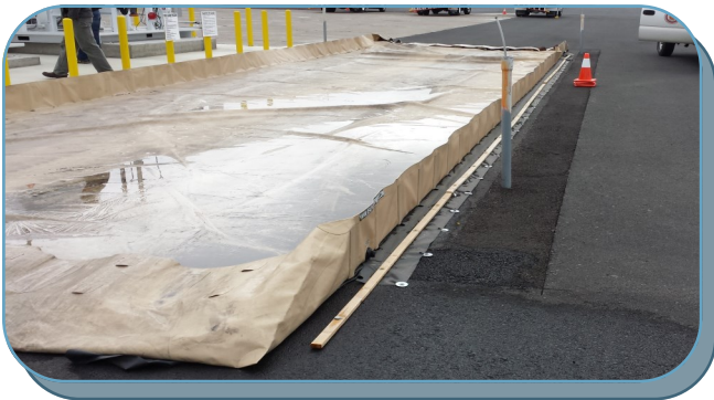
Redmond Airport Aviation Fuel System: before and after

2018 requested funds could provide up to twenty times that amount in leveraged funds, all of which make a significant difference for Oregon’s airports. The ODA works with the airports to ensure those benefits are realized as projects are delivered and aviation infrastructure brings more economic vitality to regions throughout Oregon.