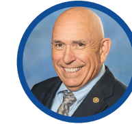
BERN CASE MEDFORD