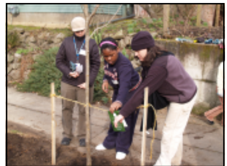
Above: Friends of Trees works with residents to plant trees along neighborhood streets.