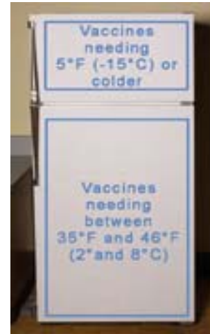
Refrigerator and freezer compartments must have separate external doors.

Compartment of such units. Sites that store large volumes of vaccine might prefer separate refrigerator and freezer since stand-alone refrigerator and freezer units maintain the required temperatures better. Whatever type of storage unit is used, the refrigerator and freezer compartments must have separate external doors. The storage unit must have enough room to store the year's largest without crowding and to store enough water bottles (in the refrigerator) and frozen packs (in the freezer) to stabilize the temperature. Additionally, the unit must function properly and reliably maintain the appropriate temperatures.