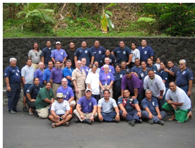
American Samoa EMS and DMAT medics

Everyone has a story to tell. The events have forever changed the lives of these responders. They now have a greater appreciation for things we take for granted. The poorest ambulance services in Oregon are better supplied than the EMS service in American Samoa. Their hearts, however, more than make up for what they lack in equipment and continuing education training.